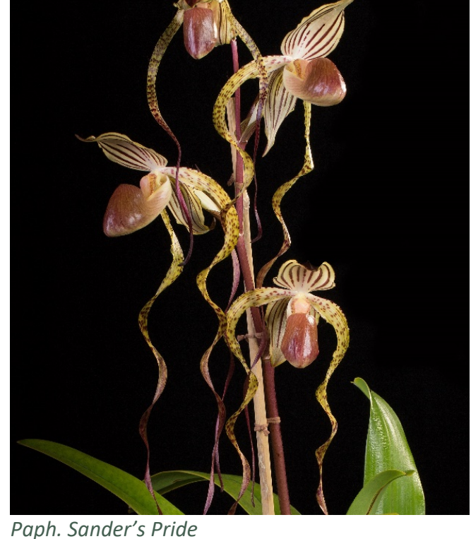
Paph. Sander's Pride Silvia Fabry – Flower Quality