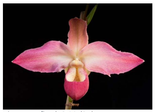
Phrag. Peruflora's Spirit (3N) Silvia Fabry — Hybrid