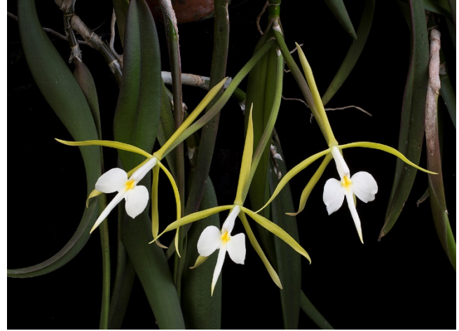
Epidendrum parkinsonianum 'Sydney Mei'