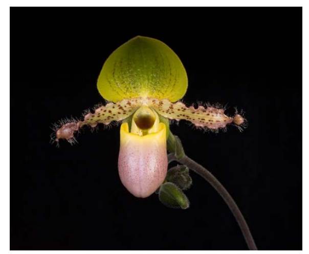
Paph. Pinocchio Hilary Bourdon – Flower Quality